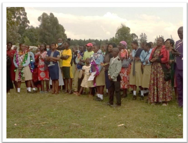
Praying over the Bamboo field