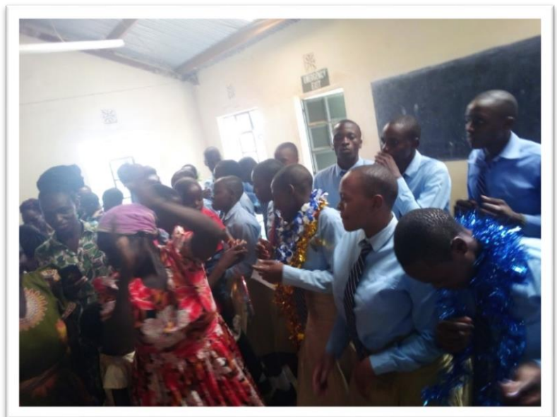
Dancing and Singing